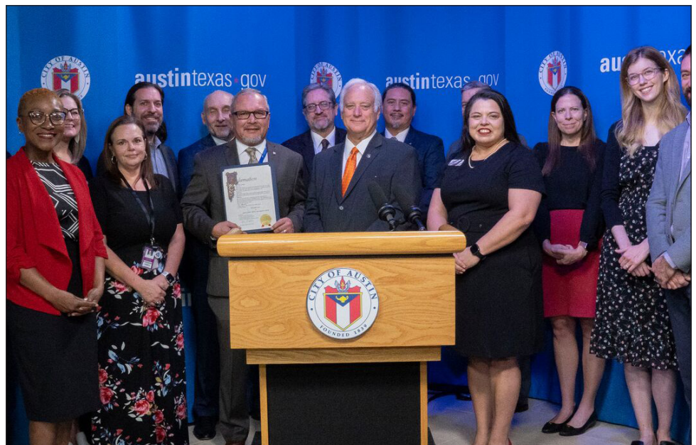
City Council Proclamation on Nov. 30, 2023

APWA Evaluators concluded that the Public Works Department achieved full compliance and recommended re-accreditation to the council. All partner departments' functional chapters were found to be in full compliance by APWA standards. This multi-departmental effort was monumental in building stronger partnerships with public works agencies within the City of Austin.